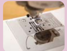
7 point feed

Extra teeth provide a smooth feeding action and superior stitch quality on any weight of fabric.