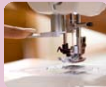
Automatic Needle threading

Threading the needle is so simple, with just the touch of a button.