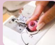
Quick set bobbin

Just drop in a full bobbin and you are ready to sew.