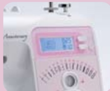
LCD display screen

A clear display showing important sewing information such as stitch width and length.